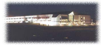
Troy Buchanan High School

Private, Nonfarm Establishments, 2006: 939 Manufacturers Shipments, 2002 ($1000): 435,524 Private, Nonfarm Employment, 2006: 9,334 Wholesale Trade sales, 2002 ($1000): 106,953 Private, Nonfarm Employment, Retail Sales, 2002 ($1000): 368,395 % Change 2000-06: 34.8% Retail Sales per Capita, 2002: $8,683 Nonemployer Establishments, 2006: 3,012 Accommodation/Food Service Sales, 2002 Total number of Firms, 2002: 3,042 ($1000): 23,325 Women-owned Firms, 2002: 36.0% Building Permits, 2007: 164 Federal Spending, 2007 ($1000) 211,075