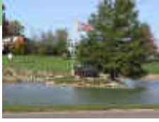
Troy Fairgrounds Park